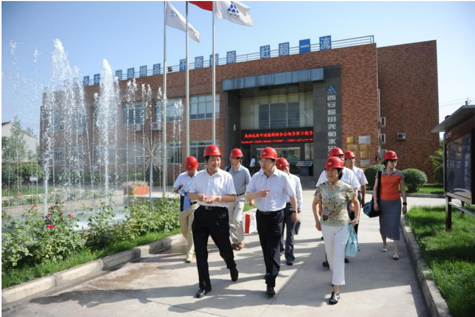
Lantian Plant visit