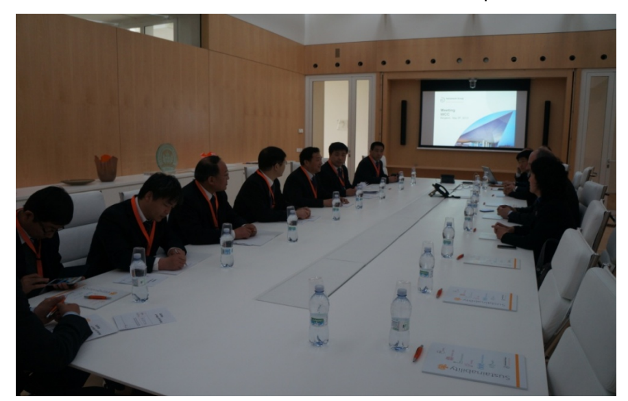
Meeting in the new i.lab