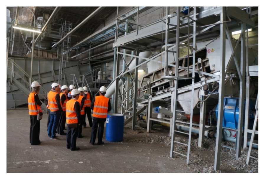
Visit in Calusco cement plant