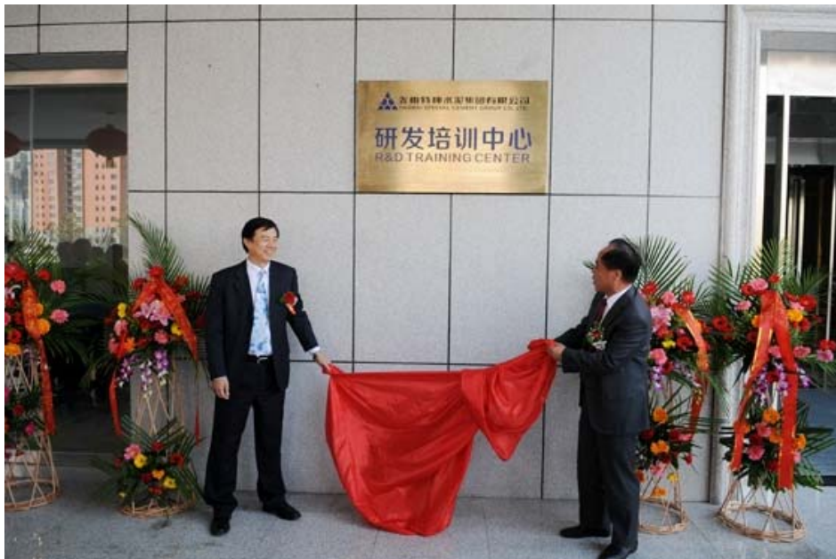
Unveiling ceremony of Yaobai R&D Training Center