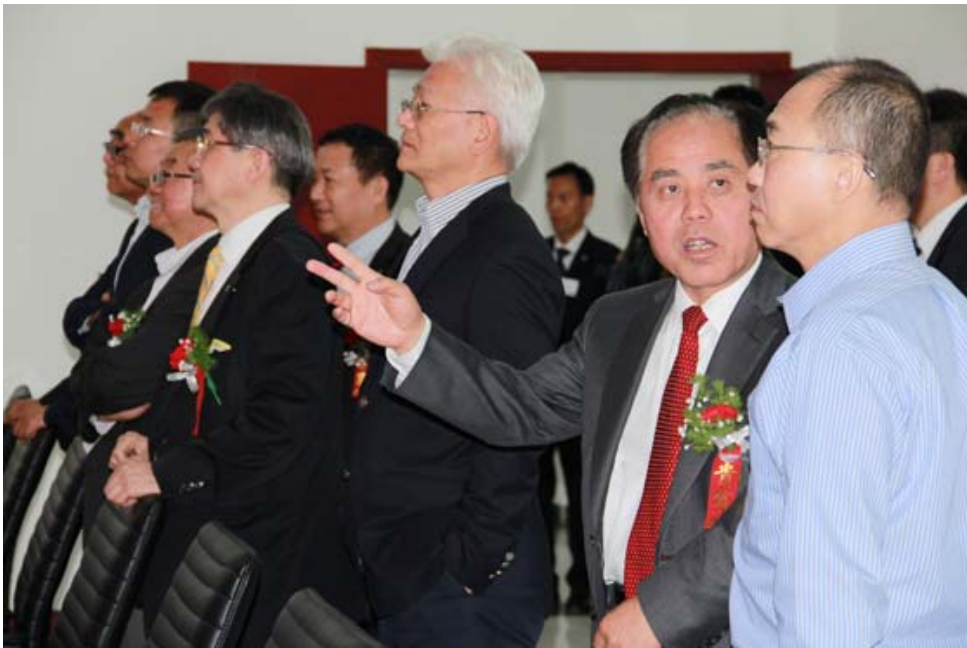
Visit the Control Center