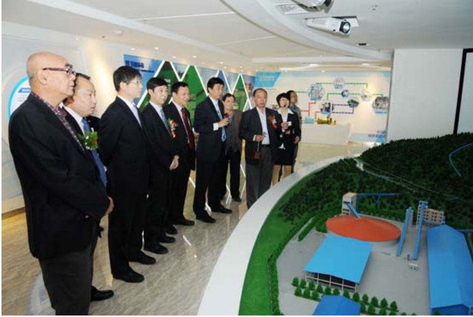
Visit the multimedia exhibition hall